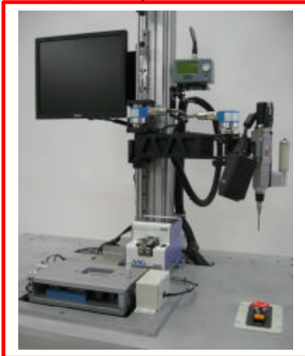
Process Sequence Software